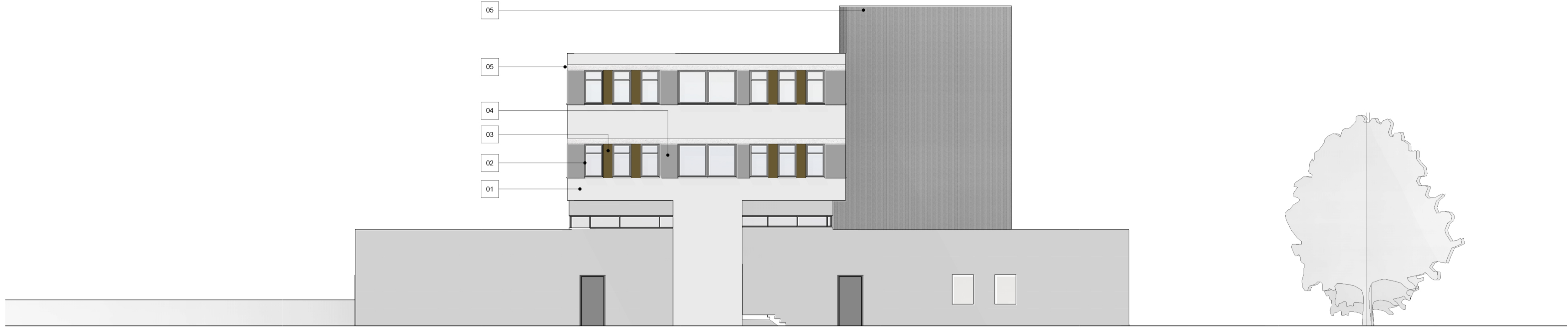
03 PROPOSED EAST ELEVATION 1 : 100

DRAWING NO. 50027 Issued 20.10.20 Revision A