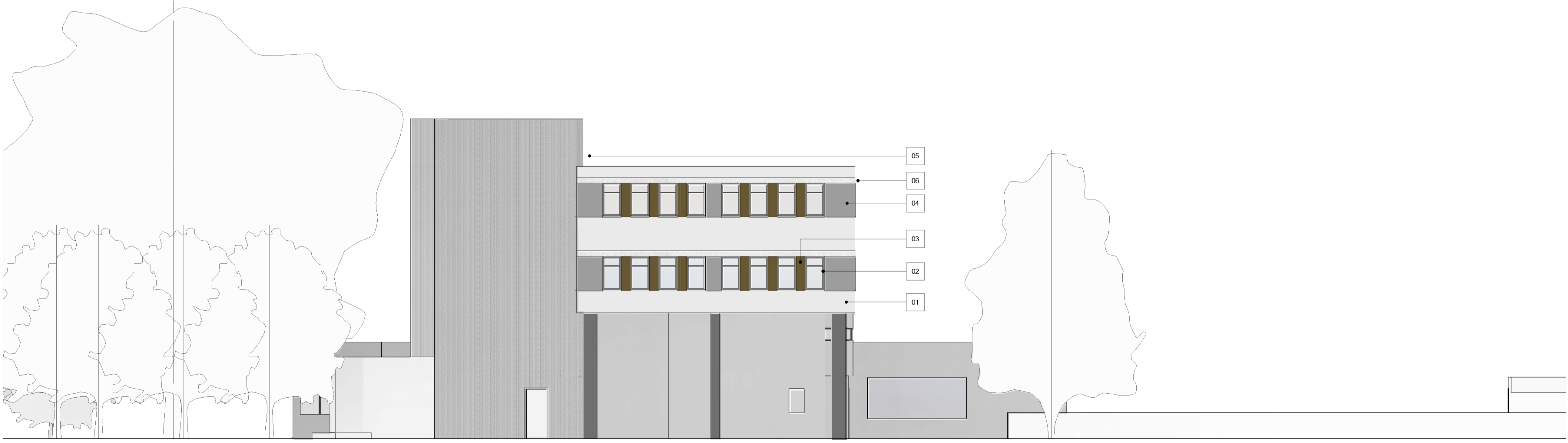
04 PROPOSED WEST ELEVATION 1 : 100